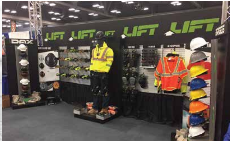
Lift Safety needed an economical, custom solution to display their products at trade shows. Two of these units display hardhats (far left and right), and for displaying safety apparel in the center.